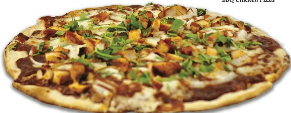
BBQ Chicken Pizza

Chicken breast, onions, cilantro and our homemade BBQ sauce.